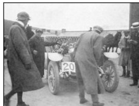
“ It was rather like a day at Ascot ”

The 100 th anniversary of the first international motor rally is being marked at the Welsh Museum of speed in Pendine. In July 1909 over 40 cars along with motorcycles and thousands of spectators descended on Pendine sands. With the national speed limit just 20mph at the time and few cars on the roads, people were hoping to see speeds in excess of 60mph. The Carmarthenshire beach has seen the world speed record broken five times but this first rally would undoubtedly have been a real spectacle at the time. It was organised by the Motor Union which later became the RAC and the event has been described as a sort of tourist board idea to bring people from all over Britain and the continent. Although the day started misty it turned into a glorious summer's day and many of the spectators were from top society sporting the latest London and Paris fashions. Those expecting to see high speeds were disappointed as the hot weather left the sand too powdery but there were a series of events for spectators to enjoy.